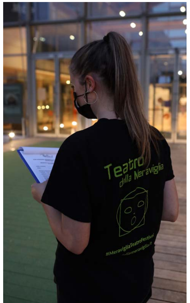
tesla 021.JPG

ALMOST THERE ! Teatro della Meraviglia 2022 About a year ago we were in the middle of the Hybrid Edition of the Italian edition of the Theatre of Wonder Festival. We are working on finally being able to welcome our audience back to the physical space, in a real, theatre! This year's edition is particularly exciting, we will have the pleasure of showcasing some of our partners' Augmented Lectures, realised within the CURIOS project, to our stage. The programme has been defined, the new graphic design, the website and the various festival side projects are just waiting for the right moment to come out! Stay tuned